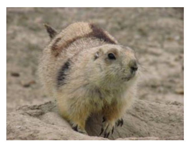
A prairie dog with a unique mark on its back

I study black-tailed prairie dogs in Grasslands National Park (GNP). They are listed as threatened by COSEWIC and GNP is the only place in Canada they can be found. These little guys are related to the gophers (Richardson's ground squirrels) that run around on campus. They live in colonies together and have special social interactions. I spend my summer observing their social behaviours like kissing, yipping, and grooming. My research is measuring the variability in their sociality and the correlation with body condition and reproductive success.